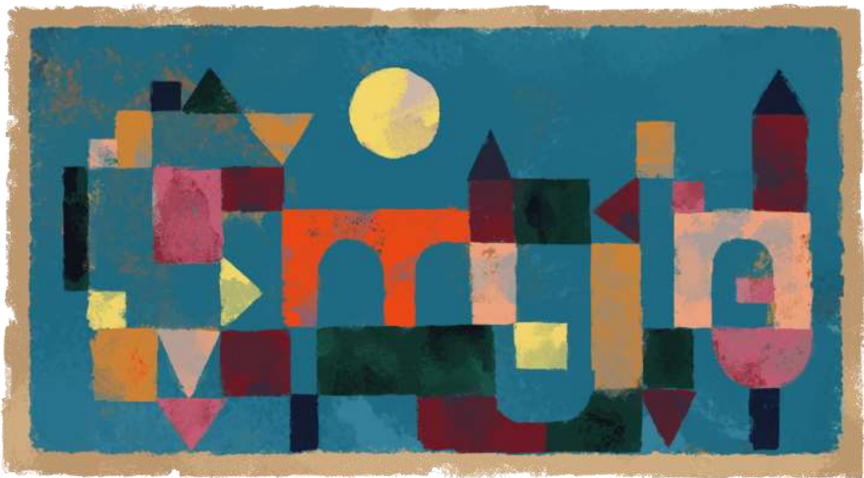
Paul Klee – Red Bridge

Invite your child to complete the attached activity sheet – Sorting Shapes.